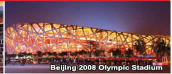
Beijing 2008 Olympic Stadium