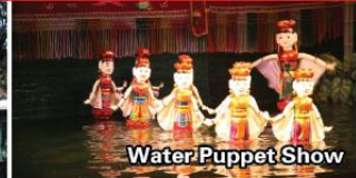
Water Puppet Show