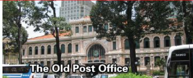
The Old Post Office